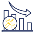
Reduction in capital investment in equipment