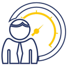
Impact on employee morale