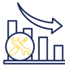
Reduction in capital investment in equipment