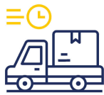
Improvement in on-time delivery