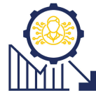
Reduction in investment in information technology