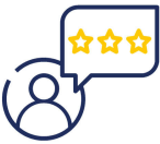
Increased customer satisfaction