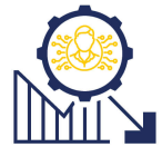
Reduction in investment in information technology