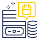
Improvement in inventory turnover rates