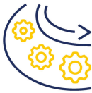
Improved logistics system performance