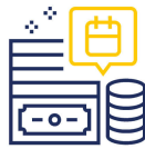
Improvement in inventory turnover rates