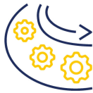
Improved logistics system performance