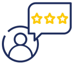
Increased customer satisfaction