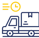
Improvement in on-time delivery