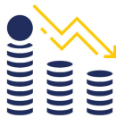
Reduction in capital investment in facilities